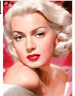
Femme fatale: Lana Turner had a string of husbands and le the contract of the second of the second of the second of the second of the second of the second of the second of the second of the second of the second of the second of the second of the second of the second of the second of the second of the second of the second of the second of the second of the second of the second of the second of the second of the second of the second of the second of the second of the second of the second of the second of the second of the second of the second of the second of the second of the second of the second of the second of the second of the second of the second of the second of the second of the second of the second of the second of the second of the second of the second of the second of the second of the second of the second of the second of the second of the second of the second of the second of the second of the second of the second of the second of the second of the second of the second of the second of the second of the second of the second of the second of the second of the second of the second of the second of the second of the second of the second of the second of the second of the second of the second of the second of the second of the second of the second of the second of the second of the second of the second of the second of the second of the second of the second of the second of the second of the second of the second of the second of the second of the second of the second of the second of the second of the second of the second of the second of the second of the second of the second of the second of the second of the second of the second of the second of the second of the second of the second of the second of the second of the second of the second of the second of the second of the second of the second of the second of the second of the second of the second of the second of the second of the second of the second of the second of the second of the second of the second of the second of the second of the second of the second of the second of the second of the second of

During the years it took to research this blockbusting new biography, Blood Moon Productions fell madly in love with Lana Turner!